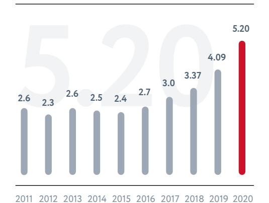
Total value of depository transactions for the 12M reporting period, calculated in accordance with NSD's